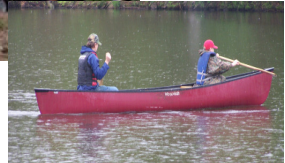
CANOE THE RIVER