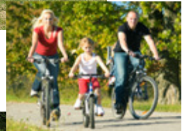
BIKE THE TRAIL